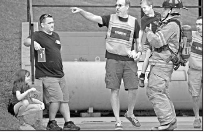
A recent drill conducted by Towns County EMA at the Georgia Mountain Fairgrounds.